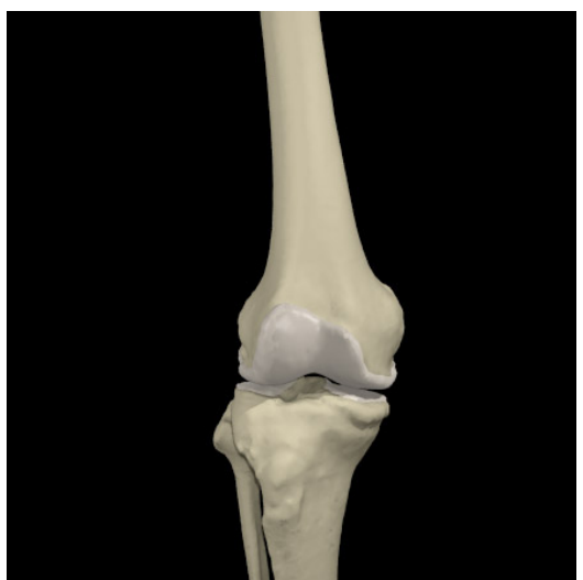
Interacti∨e Knee 1.1

We rely on the muscles that support and control the knee with virtually all of our daily activities. Simply climbing a flight of stairs or bending down to pick up the newspaper requires a complex interaction of the knee muscles to move and stabilize the area. With sports such as running, tennis, or golf the demand of the knee muscles is even greater. If any of the muscles that surround the knee become tight or weak it will place excessive strain on the other muscles and on the knee