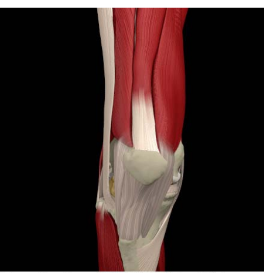
Interactive Knee 1.1