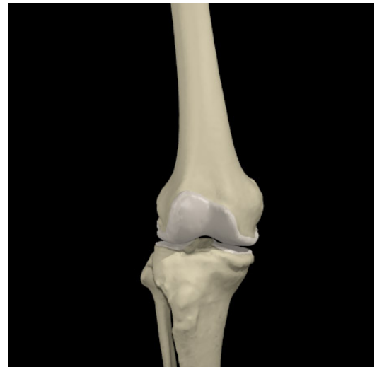
Interactive Knee 1.1 © 2000 Primal Pictures Ltd.

We rely on the muscles that support and control the knee with virtually all of our daily activities. Simply climbing a flight of stairs or bending down to pick up the newspaper requires a complex interaction of the knee muscles to move and stabilize the area. With sports such as running, tennis, or golf the demand of the knee muscles is even greater. If any of the muscles that surround the knee become tight or weak it will place excessive strain on the other muscles and on the knee