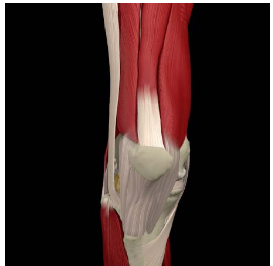
Interactive Knee 1.1